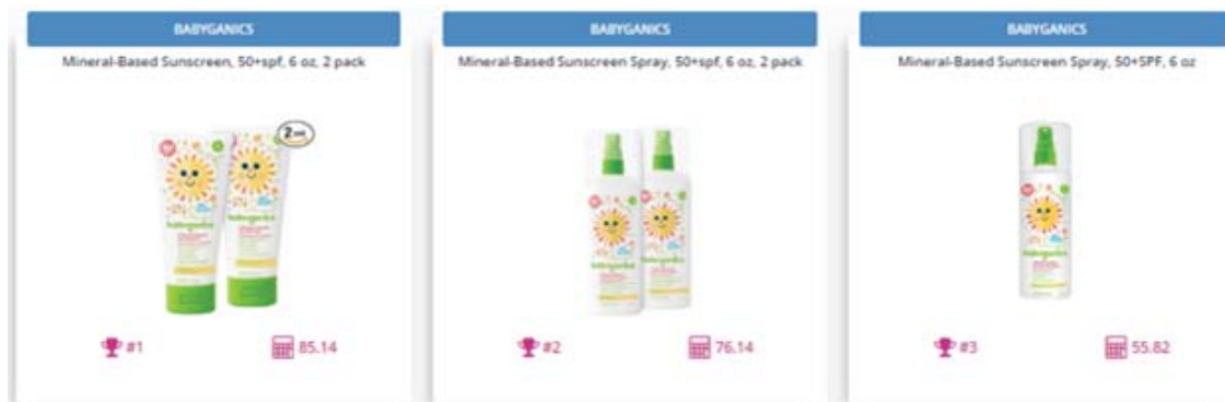
Top Ranked Sunscreen Products in Kline's Amalgam Tool for Babyganics

In Amalgam, the brand's top ranked products include Mineral-Based Sunscreen, 50+ SPF, 6 oz, 2 Pack, which ranked #3 in sunscreens in June 2018; Mineral-Based Sunscreen Spray, 50+ SPF, 6 oz, 2 Pack; and Mineral-Based Sunscreen Spray, 50+ SPF, 6 oz. These products mostly appear on Amazon and Target.com, with more than 1.2k reviews on Amazon for its top product; that product also receives a grade of "A" on Fakespot.com, a website analyzing reviews and bringing the issue of review authenticity to the forefront.