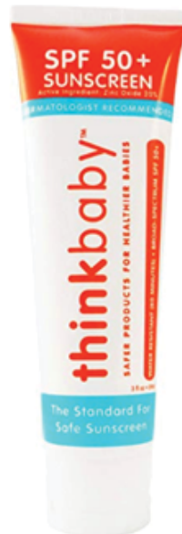
Photo of ThinkBaby Safe Sunscreen SPF 50+, a #1 Best Seller on Amazon